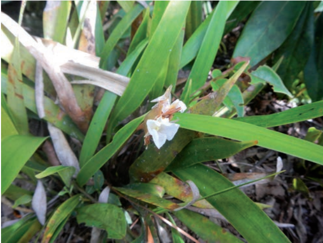
Figure 2. Rapatea isanae . Habitat (Castro-Lima et al. 18324 COL). Photograph by Gerardo A. Aymard C. taken at 0600 AM, 8 May 2014.